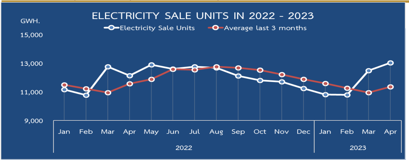
The Electricity Sales Report of PEA in April 2023

In April 2023, PEA had a total of 13,021.12 million units of electricity sales, which increased at 7.38% YoY. Because tourism grew up relating to a number of tourists, especially foreigners, from an unfolding of COVID-19. Moreover, there were a relaxation of arrival measure and Songkran Festival to attract travelers. Consumer confidence rose resulting from a downward of inflation rate and recovery of employment. The government projects were still running. In addition, Temperature was higher than previous year.